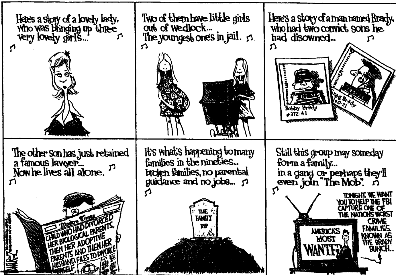
THE BRADY BUNCH (1990's) ®