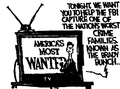
THE THE PARTY OF PARTY AND THE PARTY T

Still this group may someday form a family... in a gang or perhaps they'll even join "The Mob".