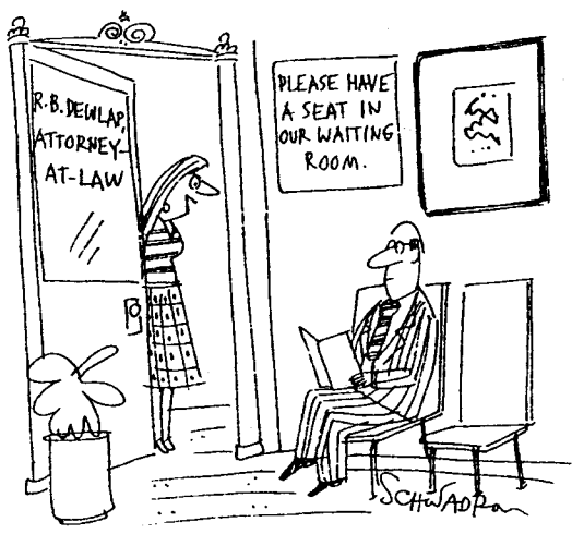
"Better not dawdle. Mr. Dewlap has already started billing." The Wall Street Journal, July 31,1996 Reprinted with permission.

The views expressed herein are those of the authors and do not imply official approval by FACE-NJ. Copyright © 1996 Fathers' and Children's Equality Inc. - NJ P.O. Box 2471, Cinnaminson, NJ 08077 609-786-FACE